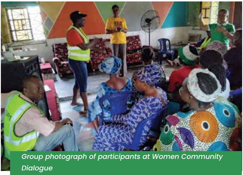
Group photograph of participants at Women Community Dialogue