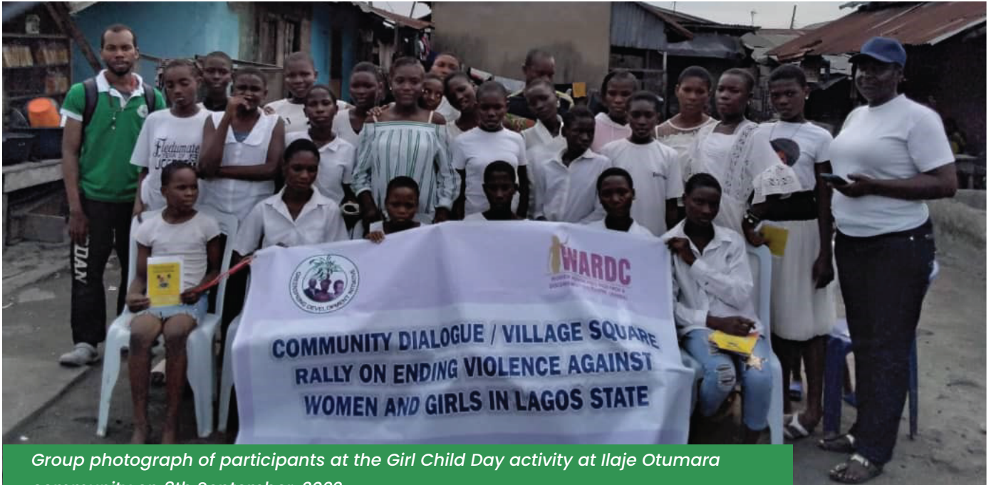
Group photograph of participants at the Girl Child Day activity at Ilafe Otumara community on 8th September, 2022