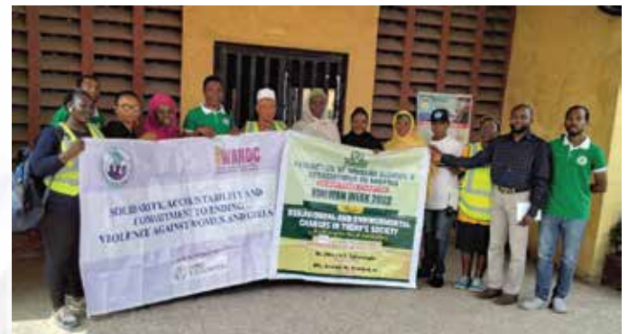
picture of the visit to Federation of Muslim Women Association of Nigeria (FOMWAN) Lagos Chapter