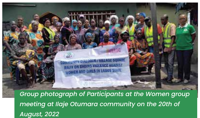
Group photograph of Participants at the Women group meeting at Ilaje Otumara community on the 20th of August, 2022