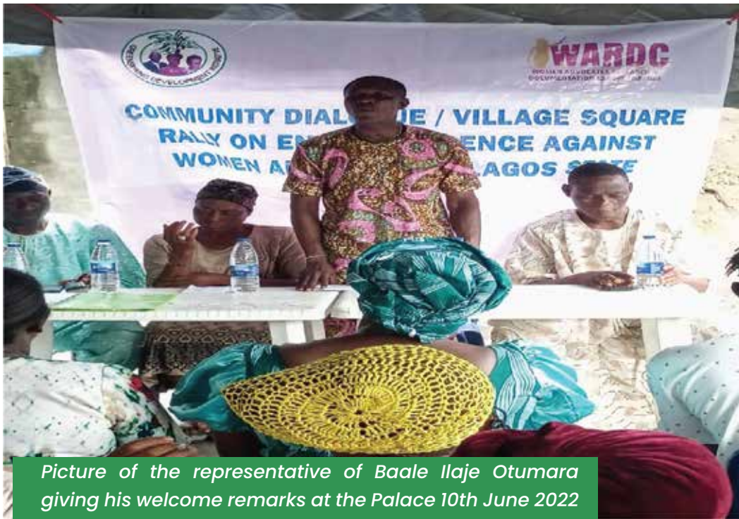
Picture of the representative of Baale Ilaje Otumara giving his welcome remarks at the Palace 10th June 2022