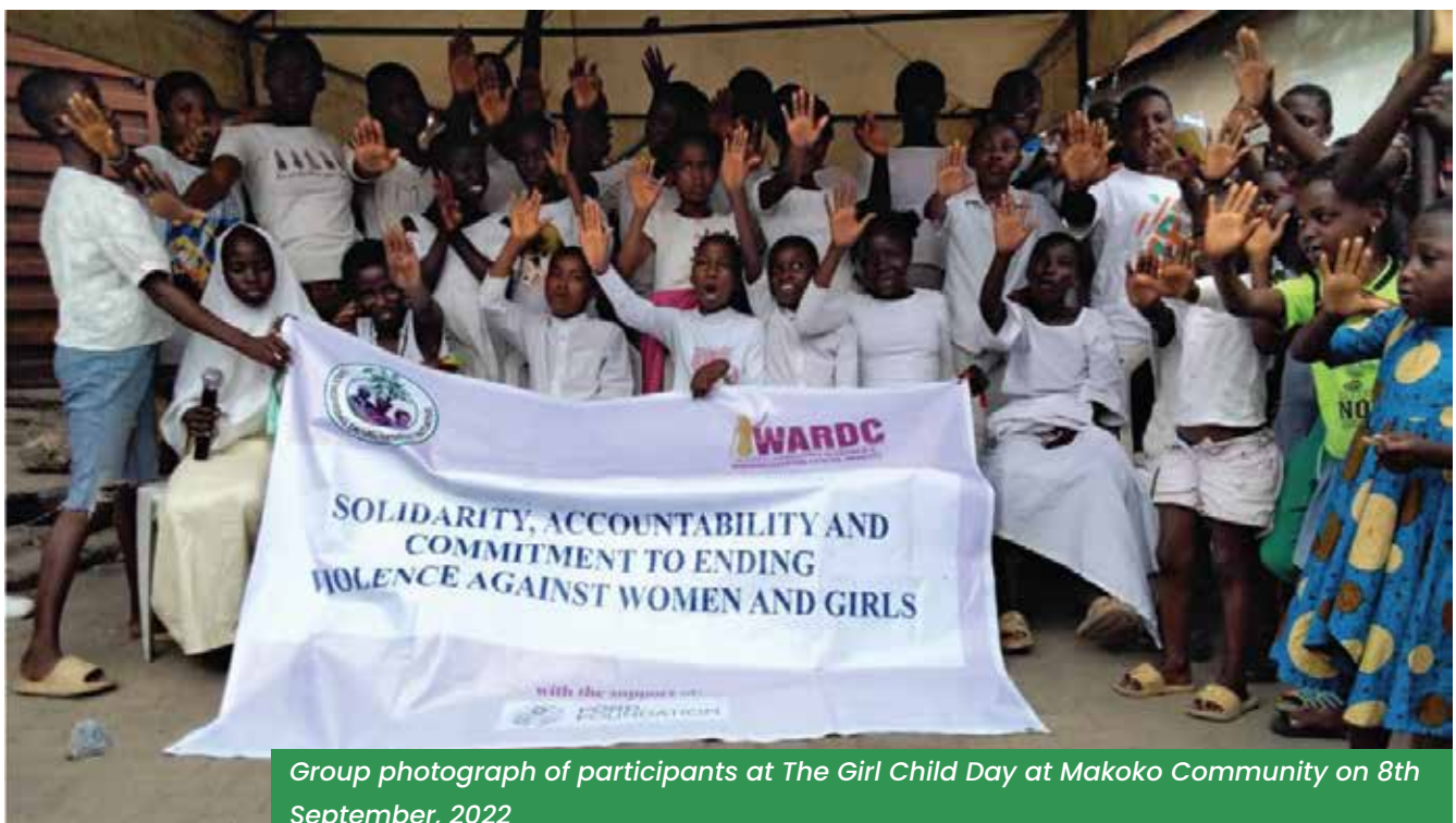
Group photograph of participants at The Girl Child Day at Makoko Community on 8th September, 2022