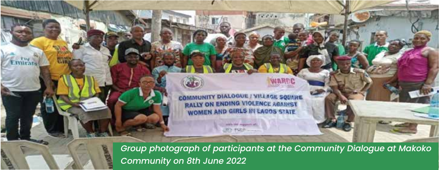
Group photograph of participants at the Community Dialogue at Makoko Community on 8th June 2022