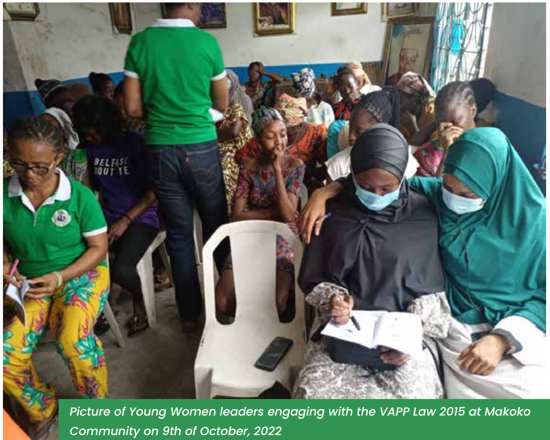
Picture of Young Women leaders engaging with the VAPP Law 2015 at Makoko Community on 9th of October, 2022