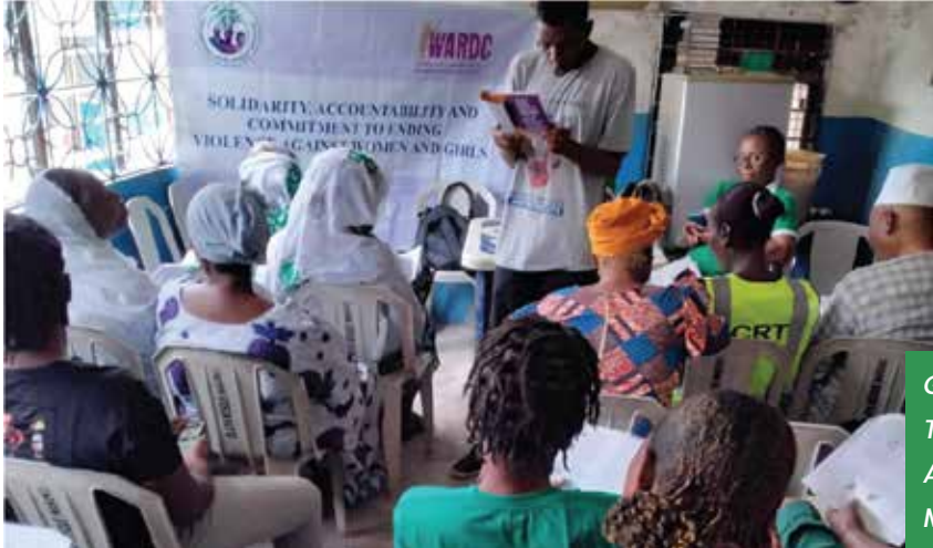
Group photograph of participants at Training of Women groups on the Violence Against Persons Prohibition Law (2015) at Makoko community