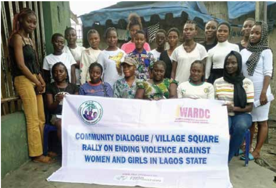
Group photograph of Young Women leaders at Ilaje Otumara Community on 9th October, 2022