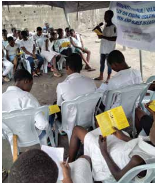
Group photograph of participants at Ilafe Otumara Community Engagement with young girls on the Lagos State Yellow Card on Child Abuse