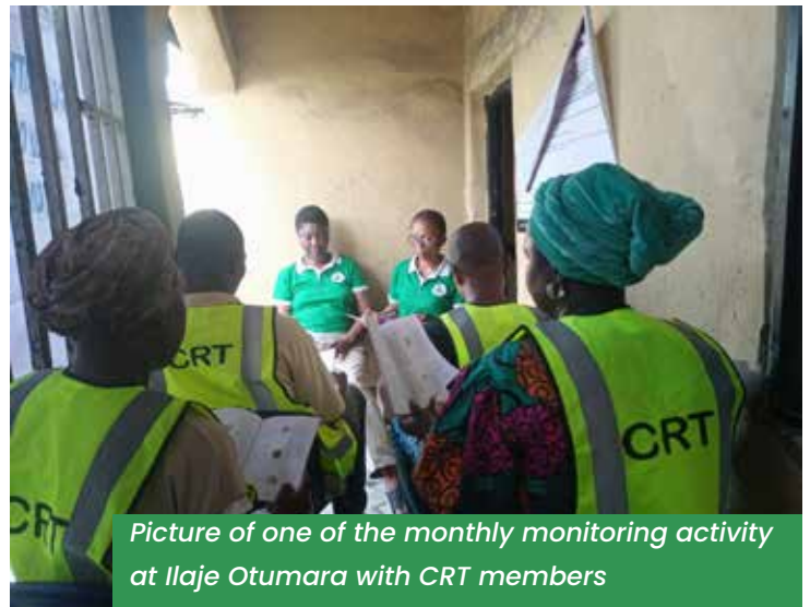
Picture of one of the monthly monitoring activity at Ilaje Otumara with CRT members