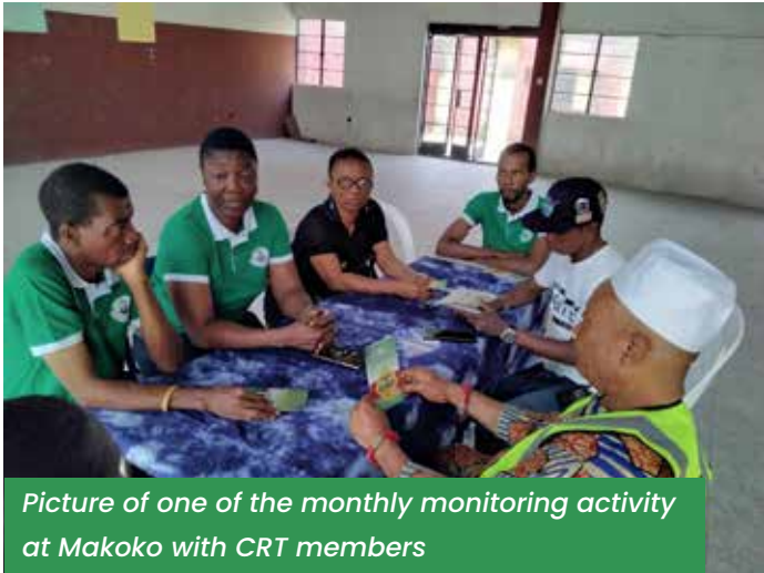
Picture of one of the monthly monitoring activity at Makoko with CRT members